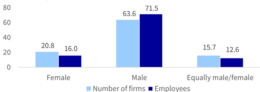
Figure 1. Percent Share by Business Ownership

In 2018, equally male/female-owned businesses (EOB), businesses half owned by men and half owned by women, totaled 860,754 employer businesses, employed 7,970,121 workers, generated $1.3 trillion in annual sales receipt, and paid $280 billion in annual payroll.* EOBs make up 15.7% of all employer businesses, compared with 20.8% majority female-owned and 63.6% majority male-owned businesses. Nearly all (99.9%) of EOBs are small businesses with fewer than 500 employees. EOBs with no employees make up 2.4 percent of all non-employers.* Most (89.6%) EOBs are family-owned.